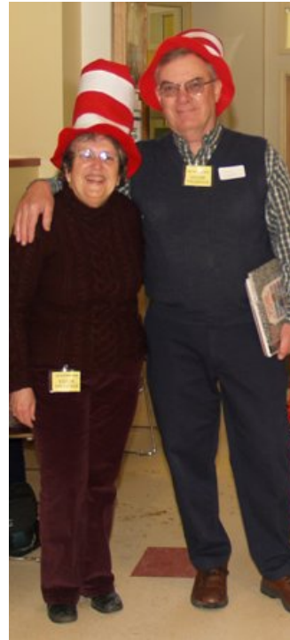
At CASS - Captain Albert Stevens School