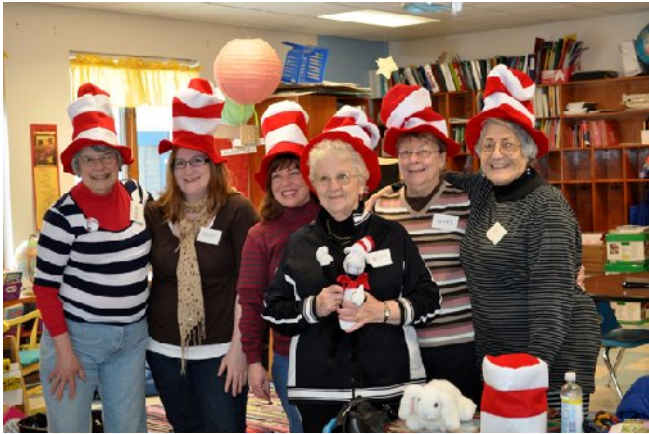
At Monroe School