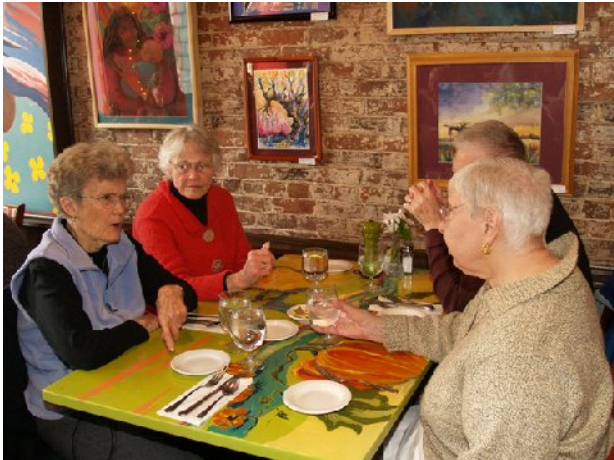
Lunch at Slate's in Hallowell