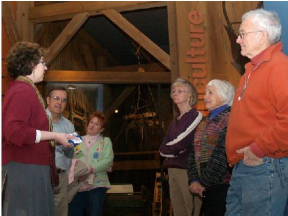
The Maine State Museum