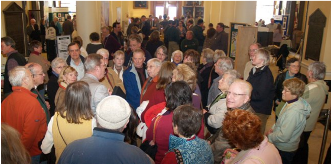
Visit the website to see the pictures in color.